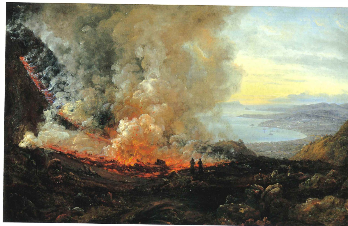
FIG. 93. Johan Christian Dahl (1788-1857): Vesuvius in eruption , 24 December 1820. Oil on canvas. 43 × 67.5 cm. Statens Museum for Kunst, Copenhagen. Inv. no. 6803.

As Grieg wrote in 1871: "Life here has given me an endless series of impressions that it would be useless to try to describe. In Rome I found peace in which to think more deeply about the greatness around me, the daily influences of a world of beauty. A northerner has in his national character so much that is heavy and reflective which in reality never gets any counterbalance in the exclusive study of German art ... A freer and more all-round view of the world and art as a whole develops down here and I consider it my