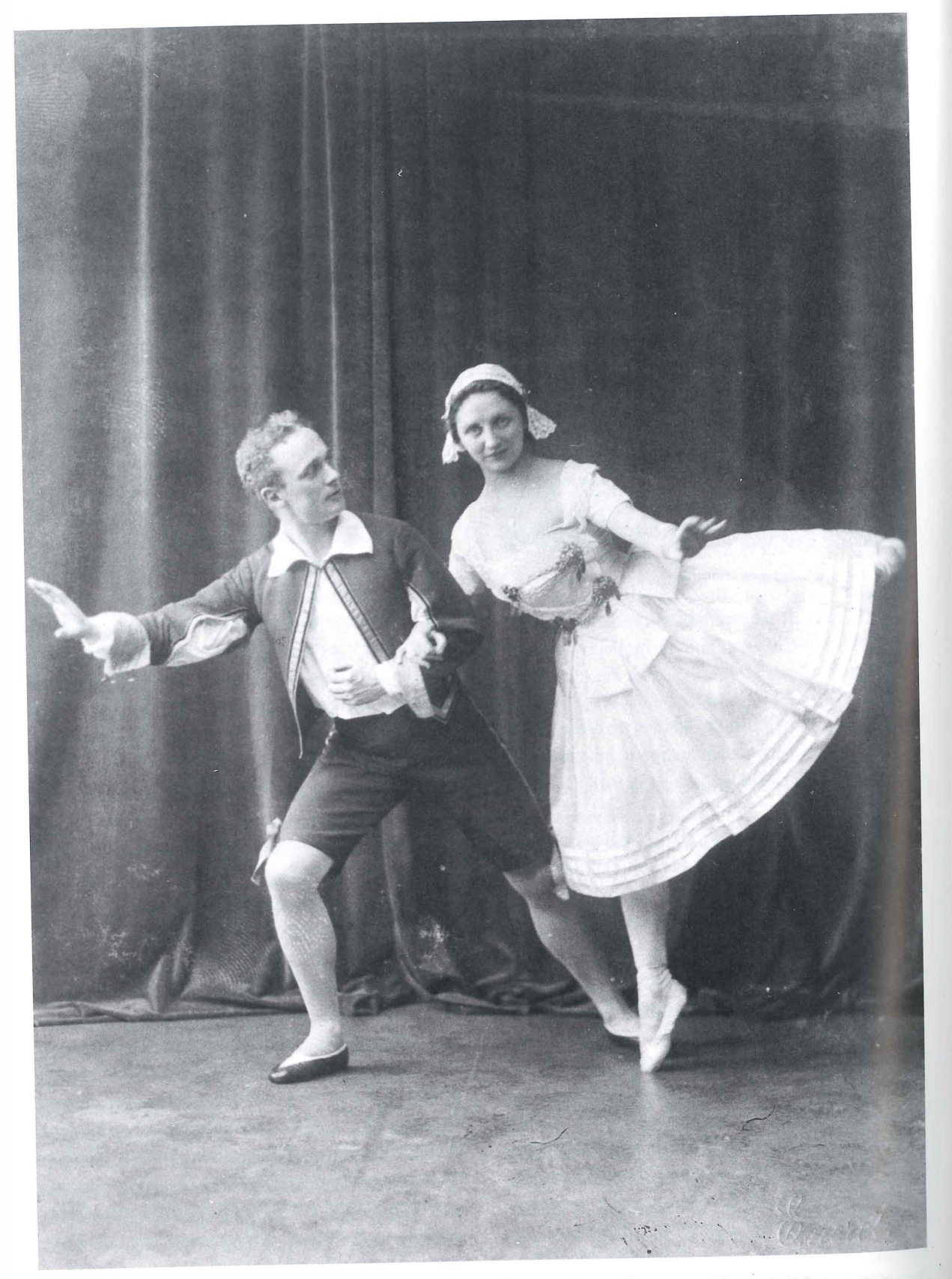
FIG. 90. Gustav Uhlendorff as Carelis and Ellen Price de Plane as Eleonore in a performance of Kermesse in Bruges, 1909.

space, their mirror-image phrases - of curving, stretching limbs - suggest yearning, and embraces that touch only in the imagination. The ingenuous lovers' excitement and daring increase by perceptible stages as they display their sweet youth and their coltish agility in alternating variations that invite the audience to fall in love with them as they are discovering each other. The fourth, final, solo is Carelis's and only now is he bold enough confidently to close the gap between him and his heart's desire. He shoots toward Eleonore, rakishly kicking up his legs, finally daring to enter the invisible envelope of air that surrounds her like a halo of chastity. The choreographer's psychology here is astute: Rather than retreating before the onslaught, Eleonore, gently wooed, does not merely consent but animatedly responds in kind, until Carelis seizes her by the waist and turns her so that they can dance, joined, in perfect harmony.