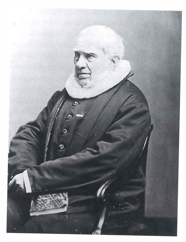
Fig. 71. Peter Christian Kierkegaard. Photo, 1875. The Royal Library, Copenhagen.

fashioned by common language and common history. It is in thoughts such as these that we find the foundation for Grundtvig's proposal for a Danish folk high school - distinct from the classical learning offered by the grammar schools and university.